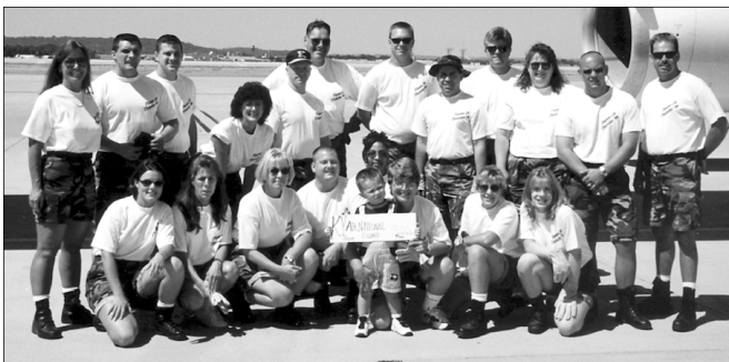
Kentucky Special Olympics