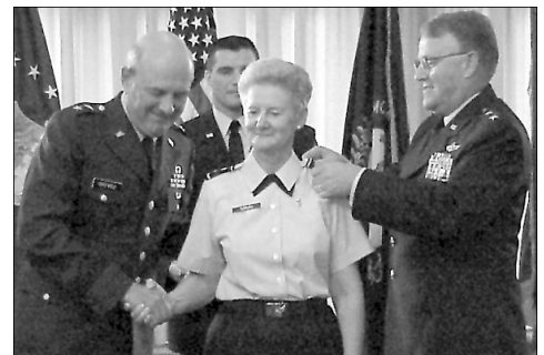
National Guard Bureau